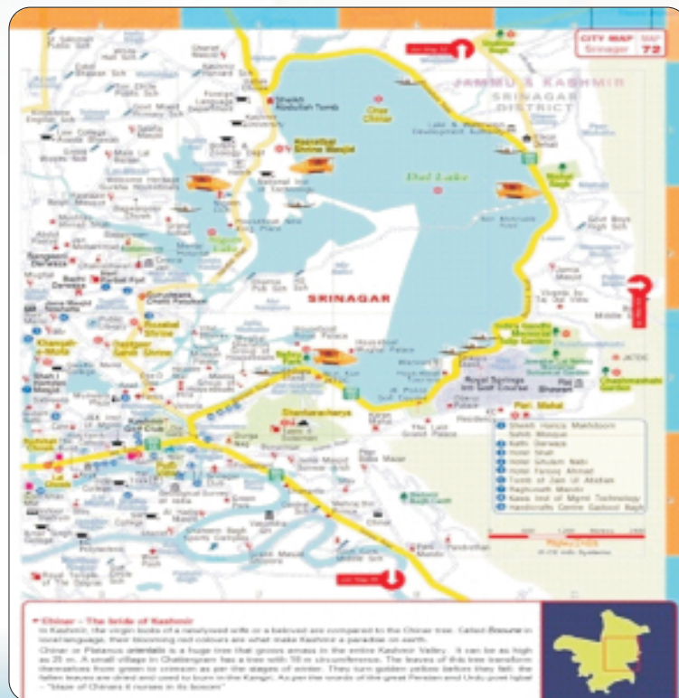
City map of Srinagar showing city map along with the tourist locations

Over 2300 POIs, detailed view of all primary areas, umpteen trekking routes, and connectivity of roads will keep the readers/visitors afresh to the 'Paradise on Earth' that is Jammu & Kashmir.