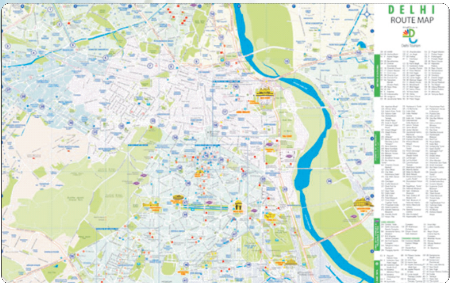
The sample of detailed route map for DELHI NCR mapbook

The book offers coverage that includes entire Delhi urban sprawl and Delhi state, Gurgaon, Faridabad, Ghaziabad, Noida, and Greater Noida urban spread at the most detailed zoom level that has ever been available for this region to date.