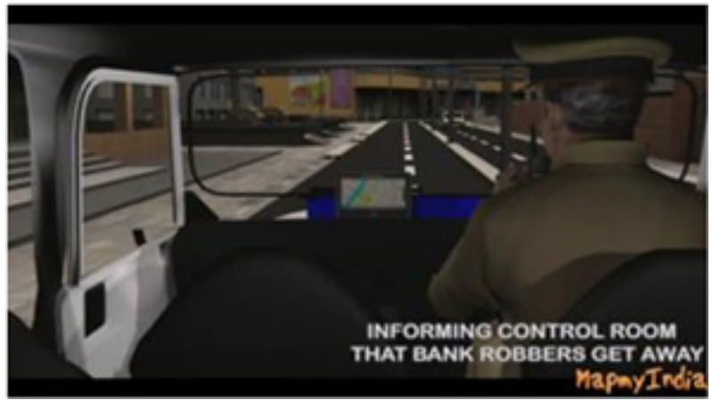
In-vehicle accurate navigation with voice guidance in local languages