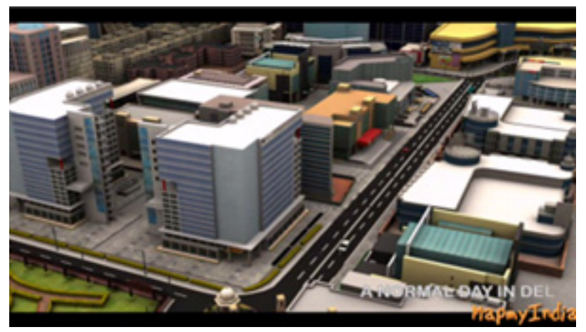
Precise Geo-referenced 3D, House & Building-level Street Map Data

To deliver a high-quality CAD solution, MapmyIndia, seamlessly integrates all our high quality elements: