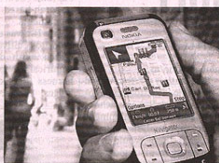
Nokia's Navigator phone